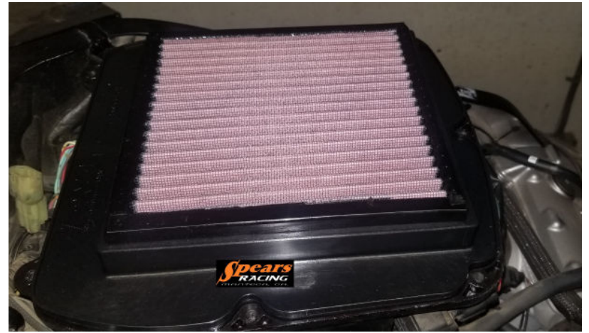
Figure 2: New DNA Air Filter

Step 4: Re-install the stock manifold clamps, Install Your choice of air filter ,Re-Install air box lid