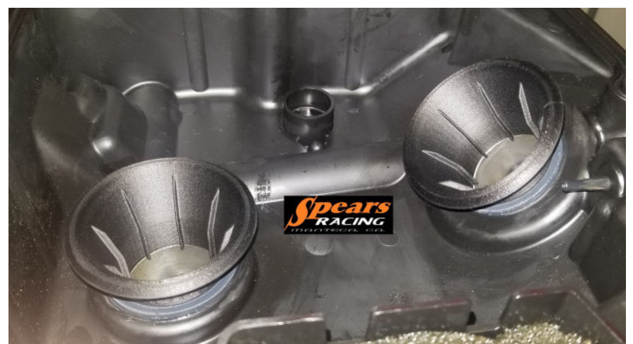
Figure 1: New manifold alignment tabs mated with the airbox alignment tabs.

Step 2: Remove the stock velocity stacks.