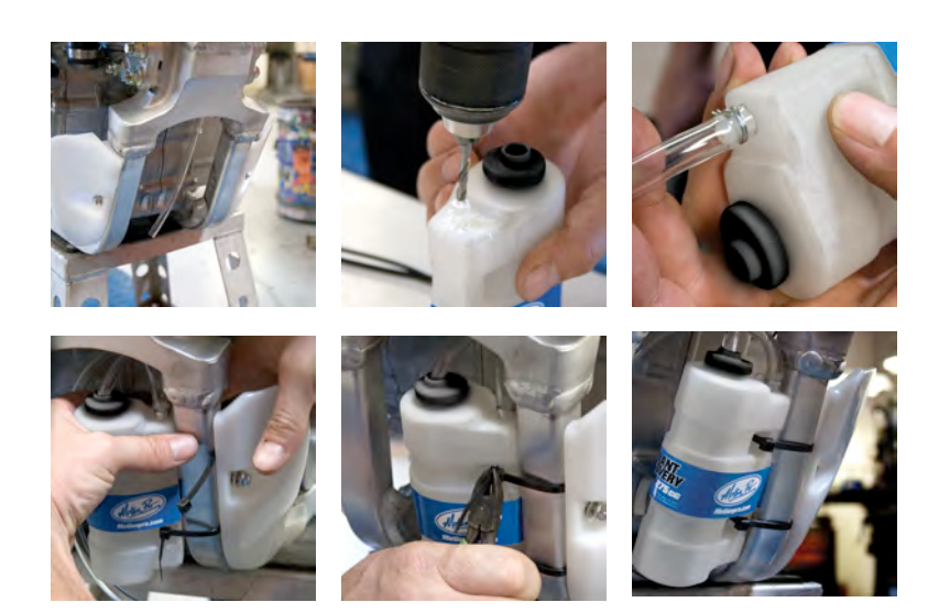
ATTENTION: Run your machine and check for leaks before you ride.