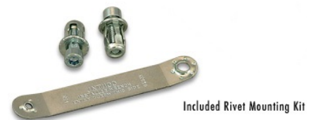
Included Rivet Mounting Kit