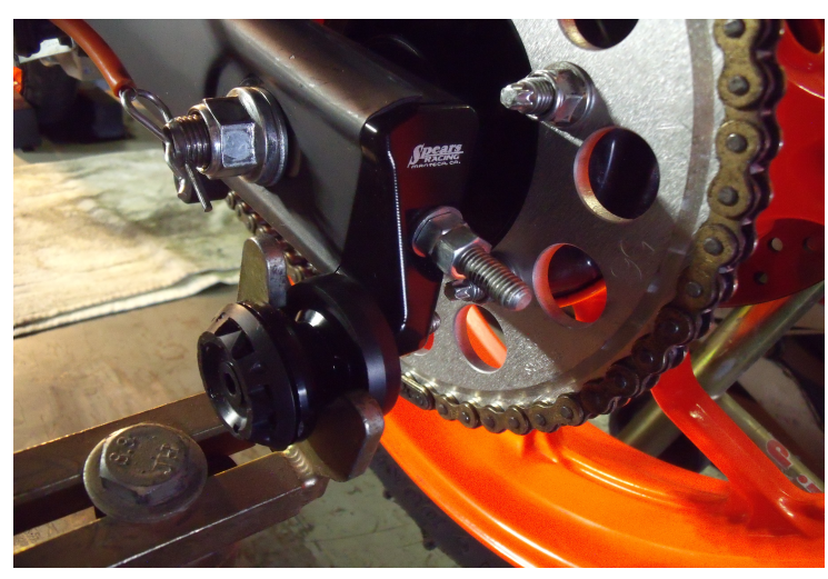
Left Side Installed