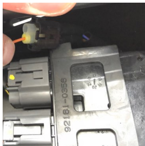
Connect loom to rear brake light connector for switch power.