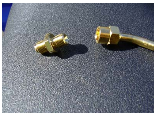
← A1 (male end that goes at caliper)