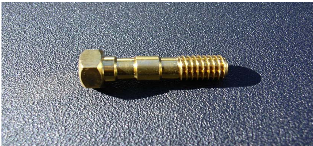
← A2 (double banjo bolt)

Spears Enterprises/ Spears Racing 15253 S. Inheritance Way, Manteca, Ca 95336 (209) 923-4684 www.spearsenterprises.com