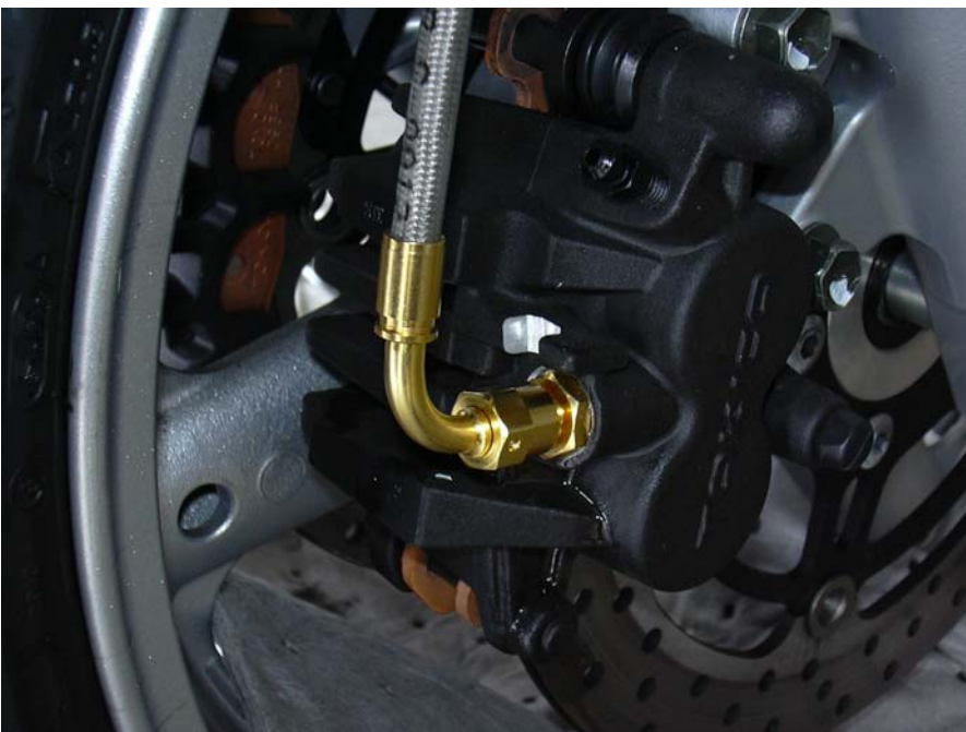
← A4 (right caliper)

Spears Enterprises/ Spears Racing 15253 S. Inheritance Way Manteca, Ca 95336 (209) 923-4684 www.spearsenterprises.com