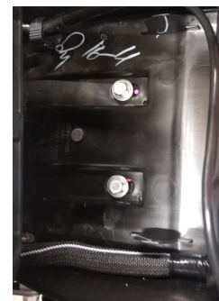
2ea 10mm bolts