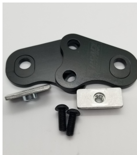
Spears Shock Mount Kit