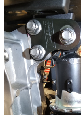
Spears Racing Mount