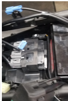
#1 cover removed